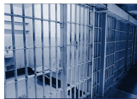
Unfortunately, you've now been arrested and your fate lies in the hands of a foreign government.

It is very easy to drive across the border into Mexico to get authentic Mexican food or to visit the beautiful beaches, and to want to bring your gun along for the ride. But don't do it! Let us say it again: absolutely do not enter into Mexico with firearms or ammunition. It could land you in a Mexican jail for an indefinite amount of time. Do you remember the fiasco that Marine Sgt. Andrew Tahmooressi endured for entering Mexico with weapons? If not, look him up, and it will change your mind.